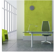
Board Membership Opportunities