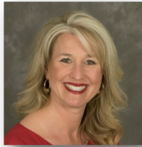
Meet the Interim BCMEA Vice President