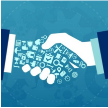
Compensation and Class Study Appeals Update