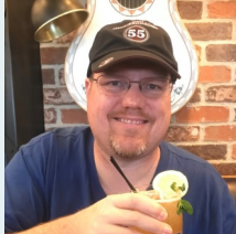
Get to know your BCMEA Treasurer