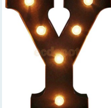
What is a Y Rating ???